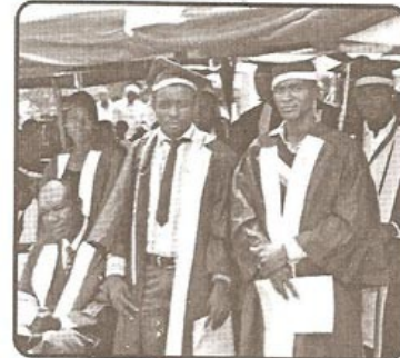
A cross section of matriculating students