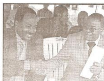
V-C & Registrar in a warm handshake

ESUT Courier is published by the Public Relations Unit, Office of the Vice-Chancellor ESUT.